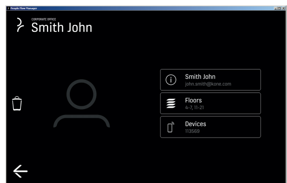
User information screen